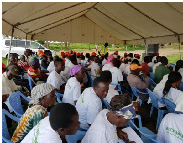
Photo 1: Participants of the advocacy campaign in Chuoye and Obaria beaches in Homabay