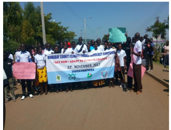
Photo 2: The advocacy procession in Homabay town on the 21 st of November, 2017

On the 21 st and the 24 th of November, 2017, DaCCA partners – SusWatch Kenya and Umande Trust organized advocacy campaigns in Homabay County. The first campaign organized by SusWatch Kenya that went by the theme “Act now! Adapt to Climate Change” attracted over 200 participants from civil society, youth and women groups, local community members and government.