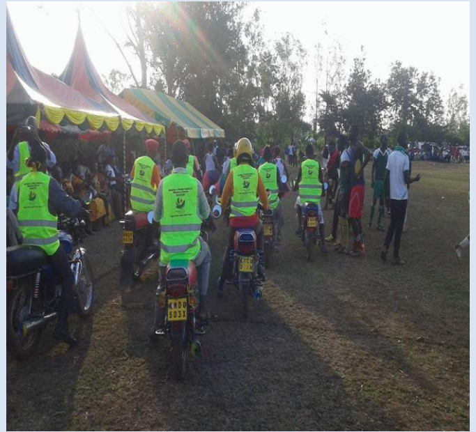
Processions during world water day celebrations.