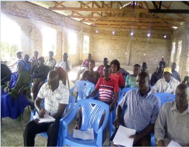
Kabonyo-Kanyagwal ward session