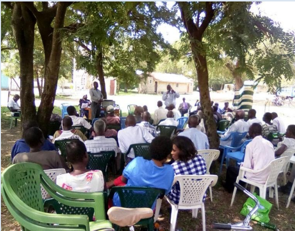
Kobura ward session