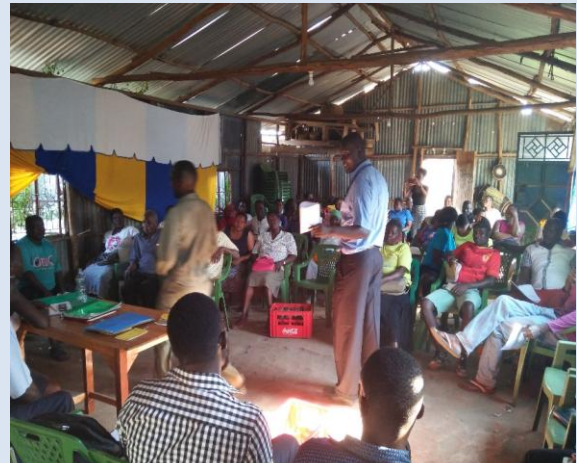
Migosi ward session