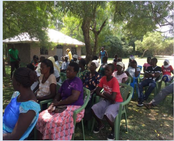
Awasi Onjiko ward session