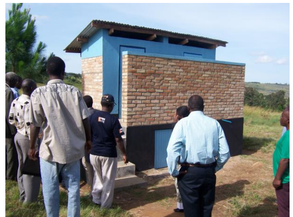
Photo 2: OSIENALA team inspecting an Ecosan Toilet constructed in a school

OSIENALA (Friends of Lake Victoria), a DaCCA programme partner, has been conducting Water, Sanitation and Hygiene (WASH) activities that seek to save lives, prevent diseases, promote dignity, and support access to better living conditions and livelihood opportunities. The organization has achieved this through direct interventions in collaboration with Village Environmental Committees (VECs) and through partnerships with other like-minded CSOs. The mode of operation chosen by OSIENALA depends primarily on the WASH needs of the targeted beneficiaries, and the quickest and most effective way to meet these needs.