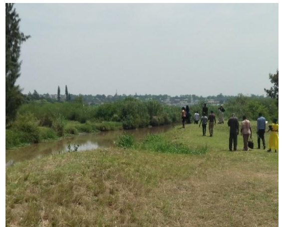
Photo 2: Site visit to the Kisat River where the river joins with Lake Victoria

The county government of Kisumu in collaboration with other stakeholders in the environment and climate change sector in the county, organized the world wetlands day in Kisumu at the Kisat wetland in Kisumu east Sub County under the global theme of “Wetlands for a Sustainable Urban Future”.