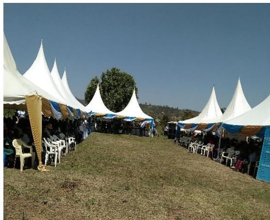
Photo 1: Kisumu county world wetlands day at Kisat wetland In Kisumu East sub -county