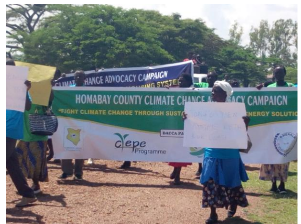
Photo 2: The procession to the Kendu Bay Show ground for the OSIENALA renewable energy campaign

The months of November and December 2017 saw the Devolution and Climate Change Adaptation in Western Kenya programme partners organize a series of climate change advocacy campaigns in the counties of Homabay and Kisumu. The campaigns which were guided by different themes focused on the subjects of adoption of a climate change policy in Homabay County, conservation of water sources, uptake of renewable energy technologies and sustainable dryland farming.