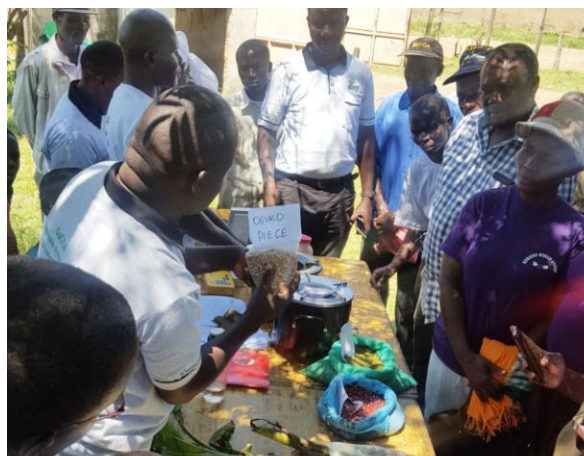
Photo 1: One of the participants at the CREPP CC advocacy campaign showcasing sustainable dryland farming products