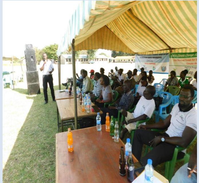
Public engagement of policy makers and county leaders on effects of climate change to the community