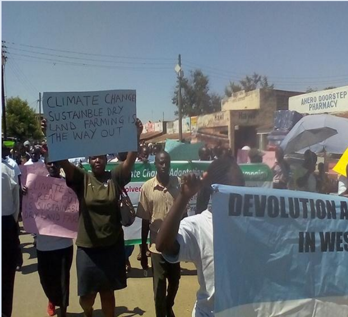
Farmers campaign for support of dry land farming from devolution funds

Some of the activities that have been undertaken in the programme include capacity building of policy makers and other county leaders, sensitization and awareness creation on climate change, mapping of climate change related risks and hazards, development of community action plans, mapping and promotion of most promising climate change adaptation technologies & practices and training on the devolved government system and the rights based approach to development.