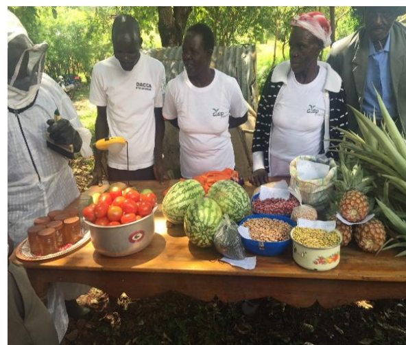
Photo 2: Farmers displaying some agricultural products at the CREPP field day

In the months of May and June 2018, the Devolution and Climate Change Adaptation (DaCCA) programme in Western Kenya partners organized a series of community advocacy meetings on the importance of citizen participation in the county budget making process. The partners also conducted community visits to monitor the climate change adaptation methods and best practice models used by farmers in Kisumu and Homabay counties. In addition, the month of June, marked the global yearly celebrations of the World Environment Day.