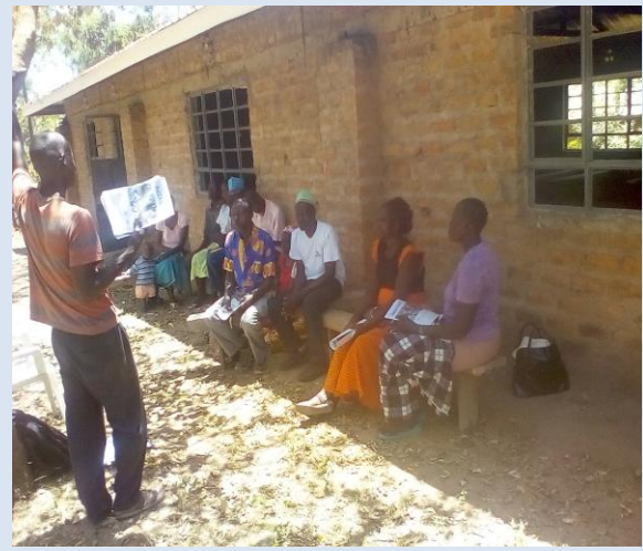
Left: Capacity building of community dialogue committee by CREPP staff Right: Community dialogue committee developing an action plan to present to the ward administrators